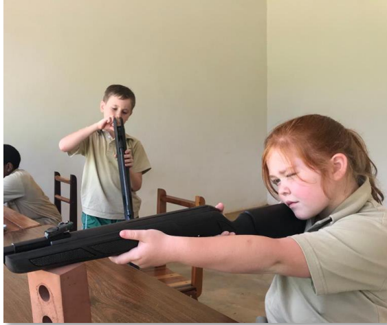
Shooting Board Games Art Cooking Club